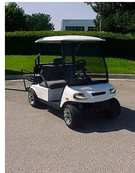
The all new TSport LSV being introduced in 2011 as a lower priced sales option.

A.C.G., Inc. is committed to continued development