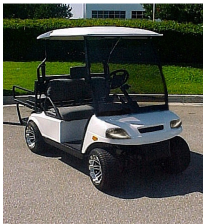
All New TSport LSV coming in 2011!!!

"We have made special efforts to control cost on this new LSV so that we can make sure the it is not only much better than what is available on the market