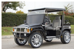
HUMMER H3© Shown with optional Top, Wheels, Chrome Package, etc.

keep an eye out in your inboxes or mailboxes for the new pricing sheets for 2011 and remove the old price sheets you have so that there is no confusion once the sales begin. We are very excited about 2011, we have new marketing plans, a road tour planned and much more!