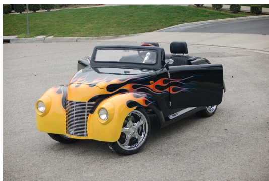
'39 Roadster with Chrome 17" Wheels and Custom Painted Flames