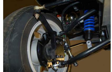
Shown here are more angles of the new suspension.

American Custom Golf Cars, Inc. 2010 has been a major development year for A.C.G., Inc. and there are many new exciting developments that are being introduced in 2011. The new suspension is only the beginning of what makes the 2011 A.C.G. line of cars— The Best Cars in the World.