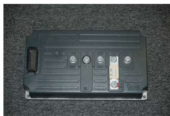
Pictured is the Sevcon Speed Controller